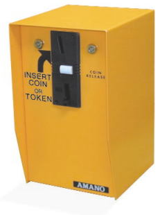
Model AGP-8200 Coin/Token