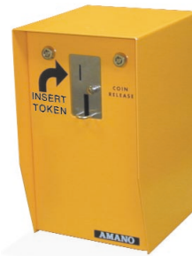
Model AGP-8000 Token-only

The Amano AGP-8000 Series Payment Station is available in three acceptance configurations - token-only, coin-only and coin/token - each providing a dry contact output to raise an entrance or exit gate as part of an Amano Parking Control System.