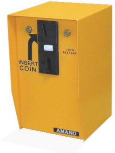
Model AGP-8100 Coin-only

These pay stations are ideal for smaller surface lots where lower fee amounts, reserve usage, day/night, weekday/weekend, or special event flexibility is desirable.